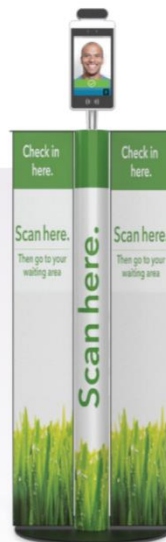
Custom Branding ( & battery options available )